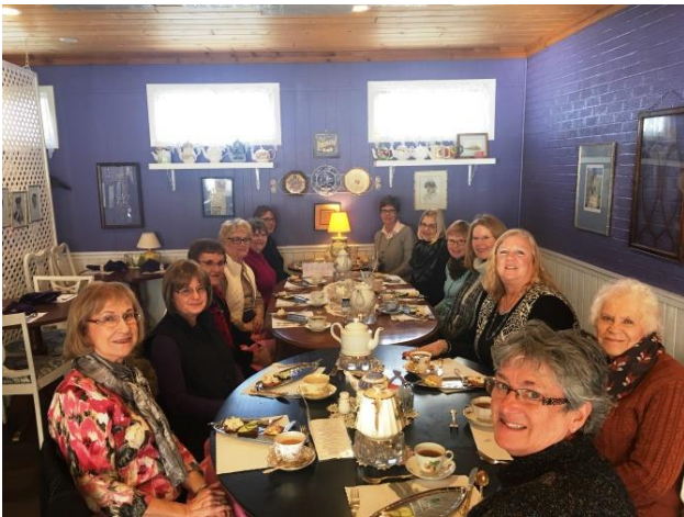
Gadabouts Tea – January 2018