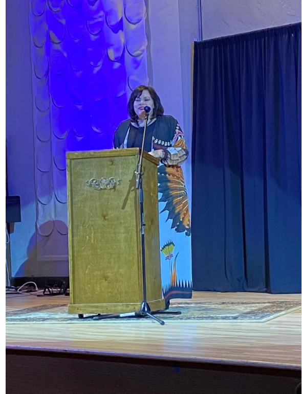
Angeline Bouley, author of Firekeeper's Daughter .