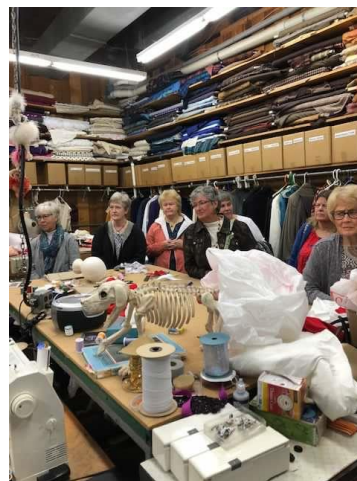
Touring backstage of Chanhassen Dinner Theater in 2018