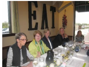
Spring Social 2017