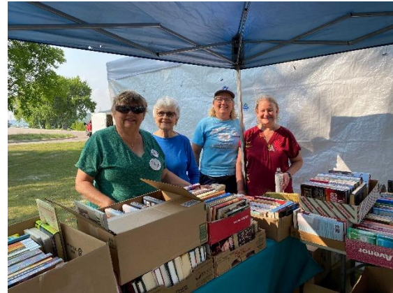
Rivertown Days book sale 2021

By Briana Bierschbach Star Tribune | MAY 6, 2024 — 12:59PM